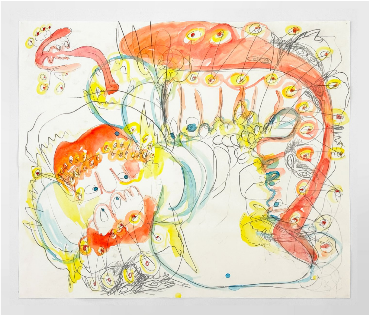
Deep Jaw Relaxation (series), 2018-19 Watercolor, pencil on paper 70 x 82 cm