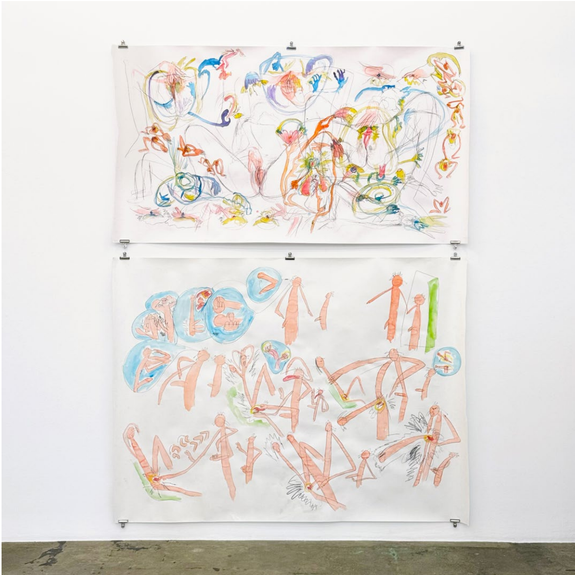
Installation view, south wall.