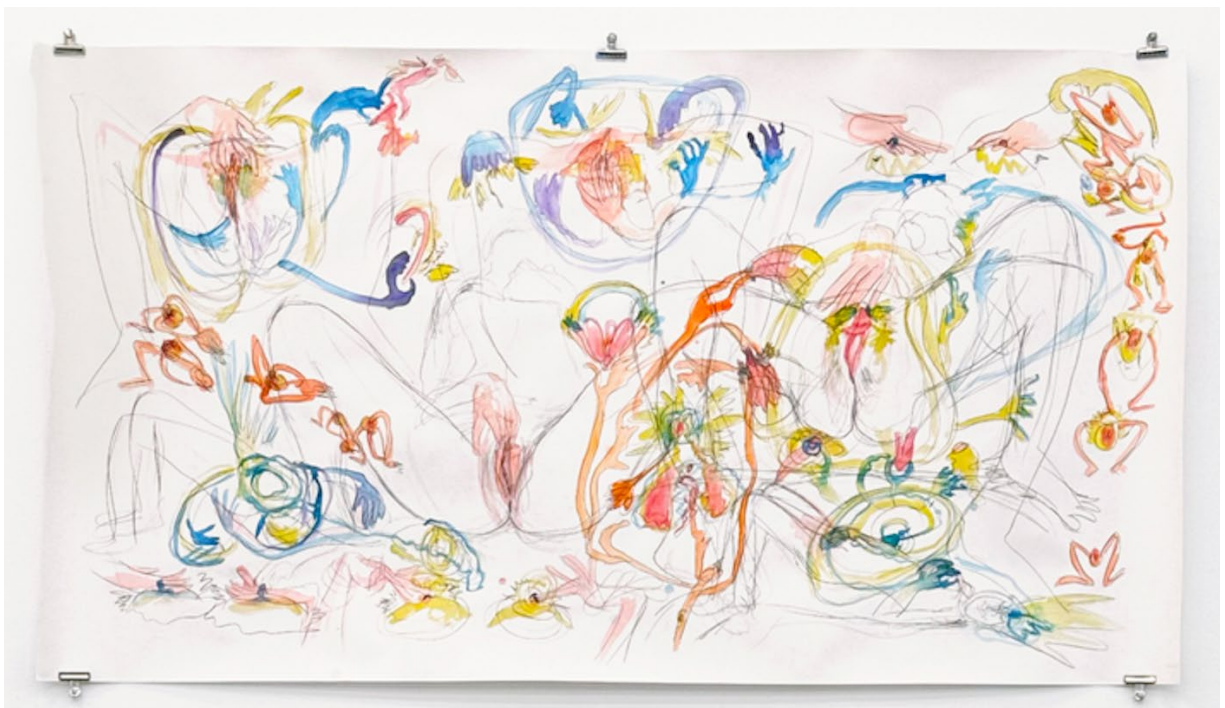
Masturbation Portraits / Vibration Highway, Woman 4, 2016 Watercolor, pencil on paper 100 x 204 cm

At Manifesta, Györi presented Vibration Highway , an impressive group of “Masturbation Portraits”: large scale works on paper drawn in private sessions with women, who – in “an act of playing together” (Györi) – were invited to pleasure themselves.