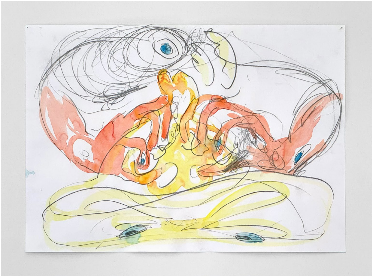
Traumatizing a Lemon (series), 2018 Watercolor, pencil on paper 29 x 42 cm