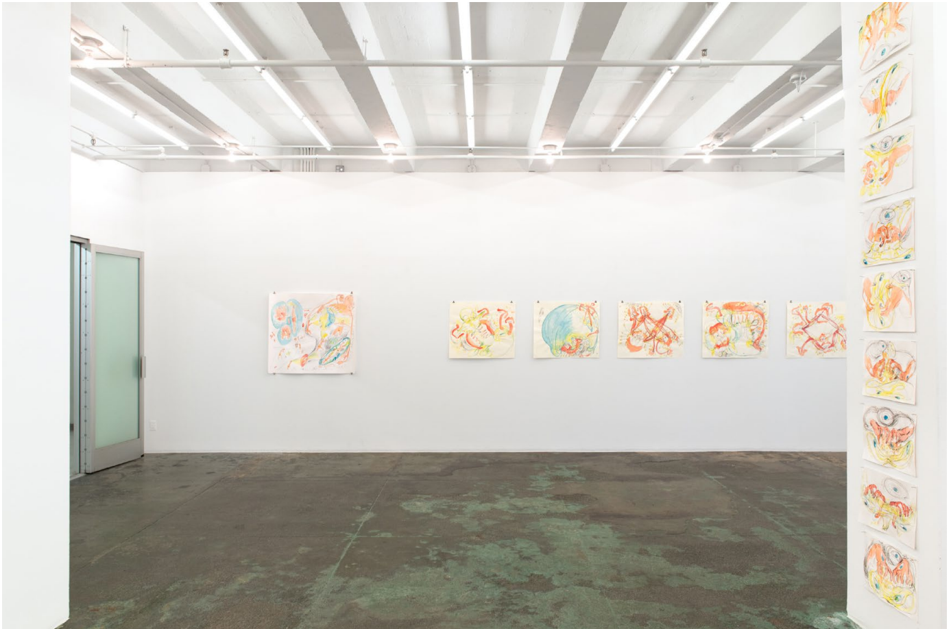
Installation view, west wall