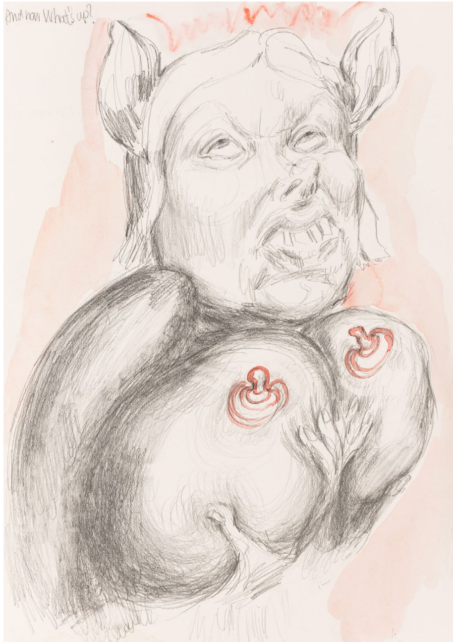
Untitled, 2022 Aquarelle, graphite on paper 42 x 29.7 cm