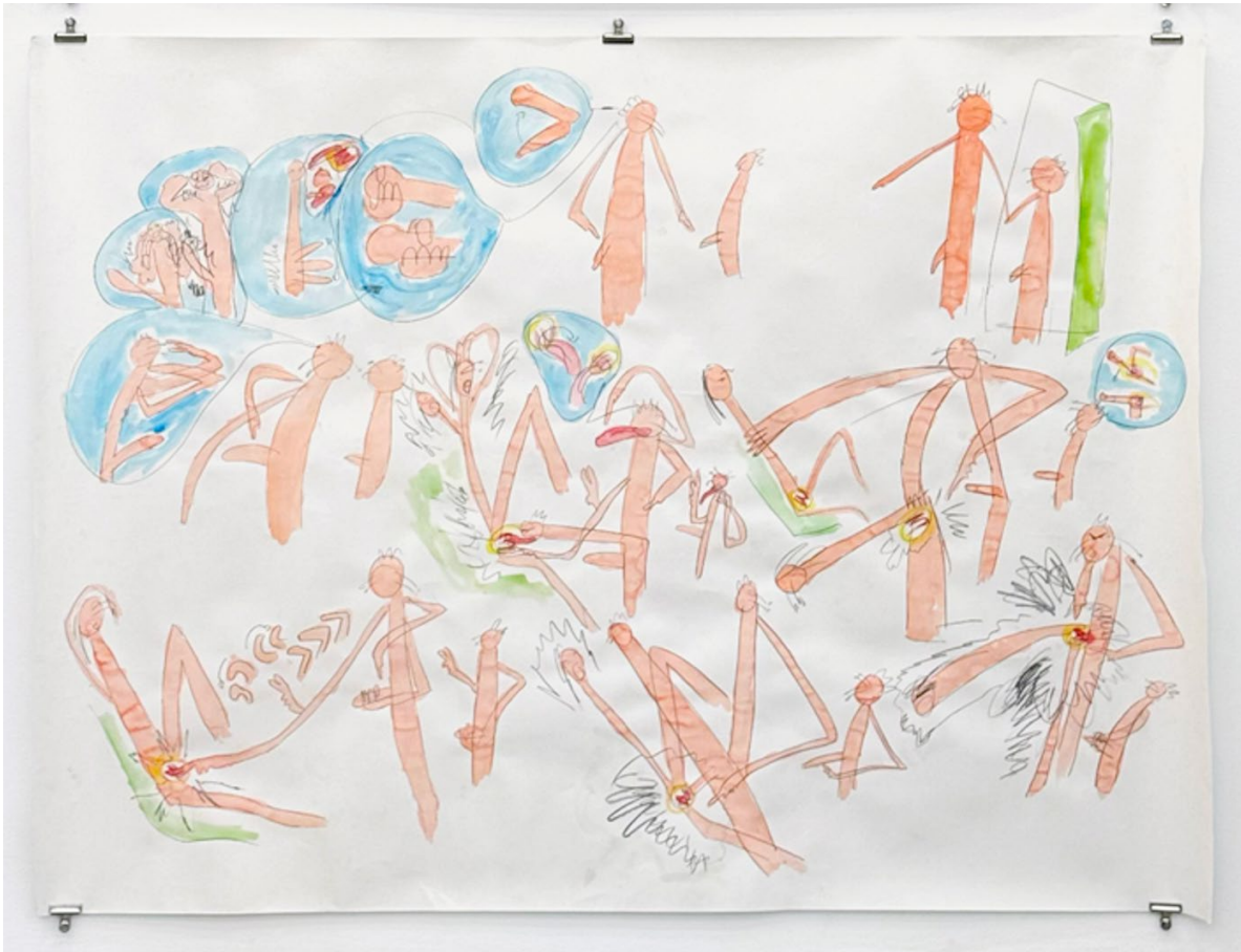
Masturbation Portraits / Phantasy Analysis, Woman 4, 2016 Watercolor, pencil on paper 150 x 204 cm

Corresponding fantasies are documented in equally sized Phantasy Analysis , with both drawings displayed together, as is the case with Woman 4 (included in the exhibition). Additional drawings are grouped under such titles as Exercises and Movements , Experiences from Childhood , and Expedition: Get to Know Your Genitals (on view) to complete the cycle, resulting in an analysis of – and guidebook to – female self-pleasure.