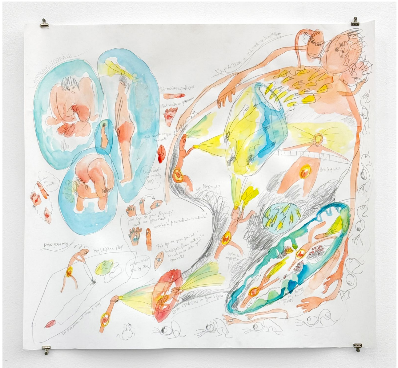
Expedition on Vibration Highway, 2016 Watercolor, pencil on paper 99.60 x 100.60 cm