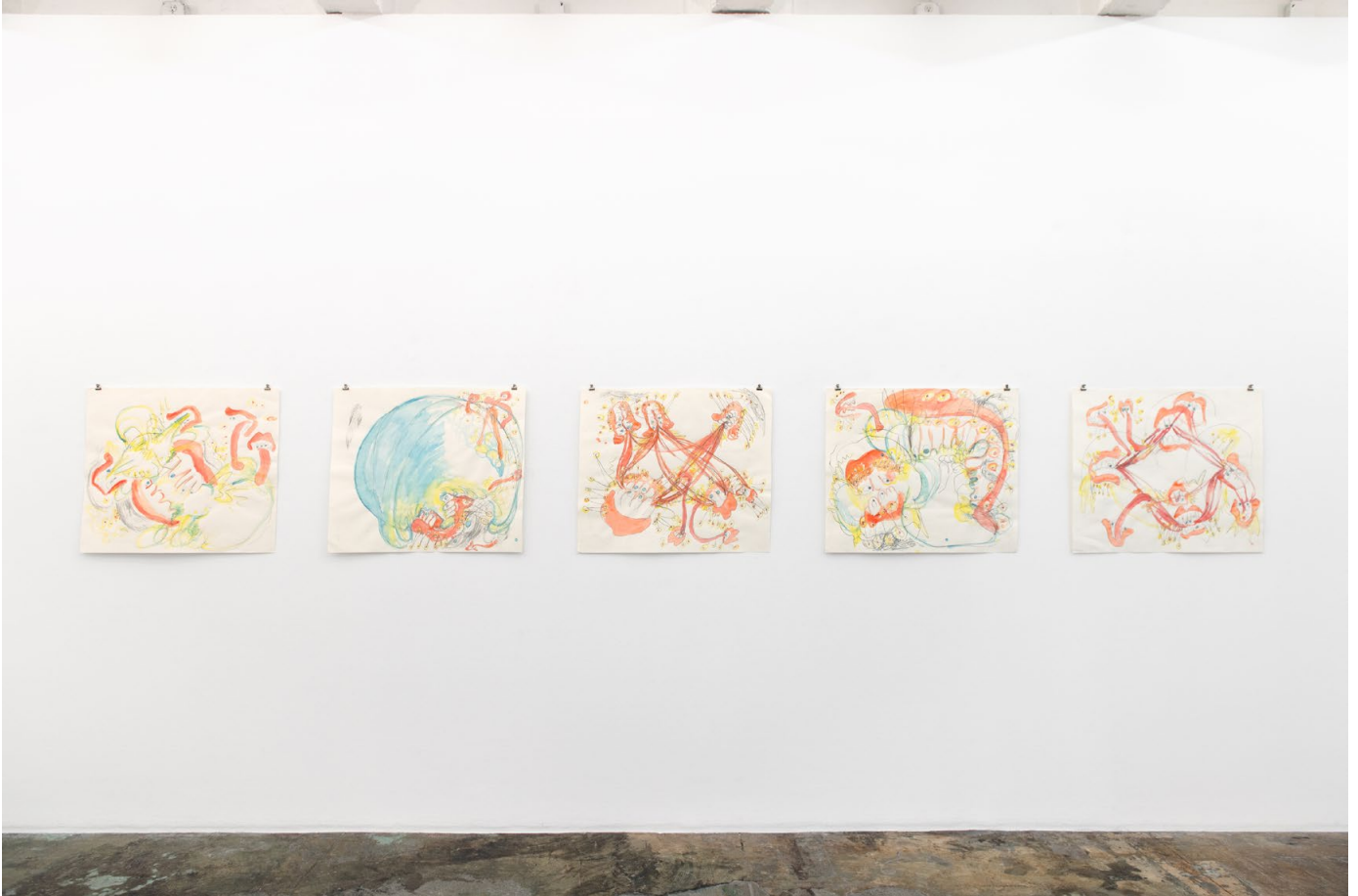
Installation view, west wall

Deep Jaw Relaxation (series) , 2018-19 Watercolor, pencil on paper 70 x 82 cm each