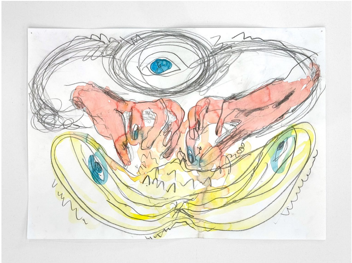
Traumatizing a Lemon (series), 2018 Watercolor, pencil on paper 29 x 42 cm