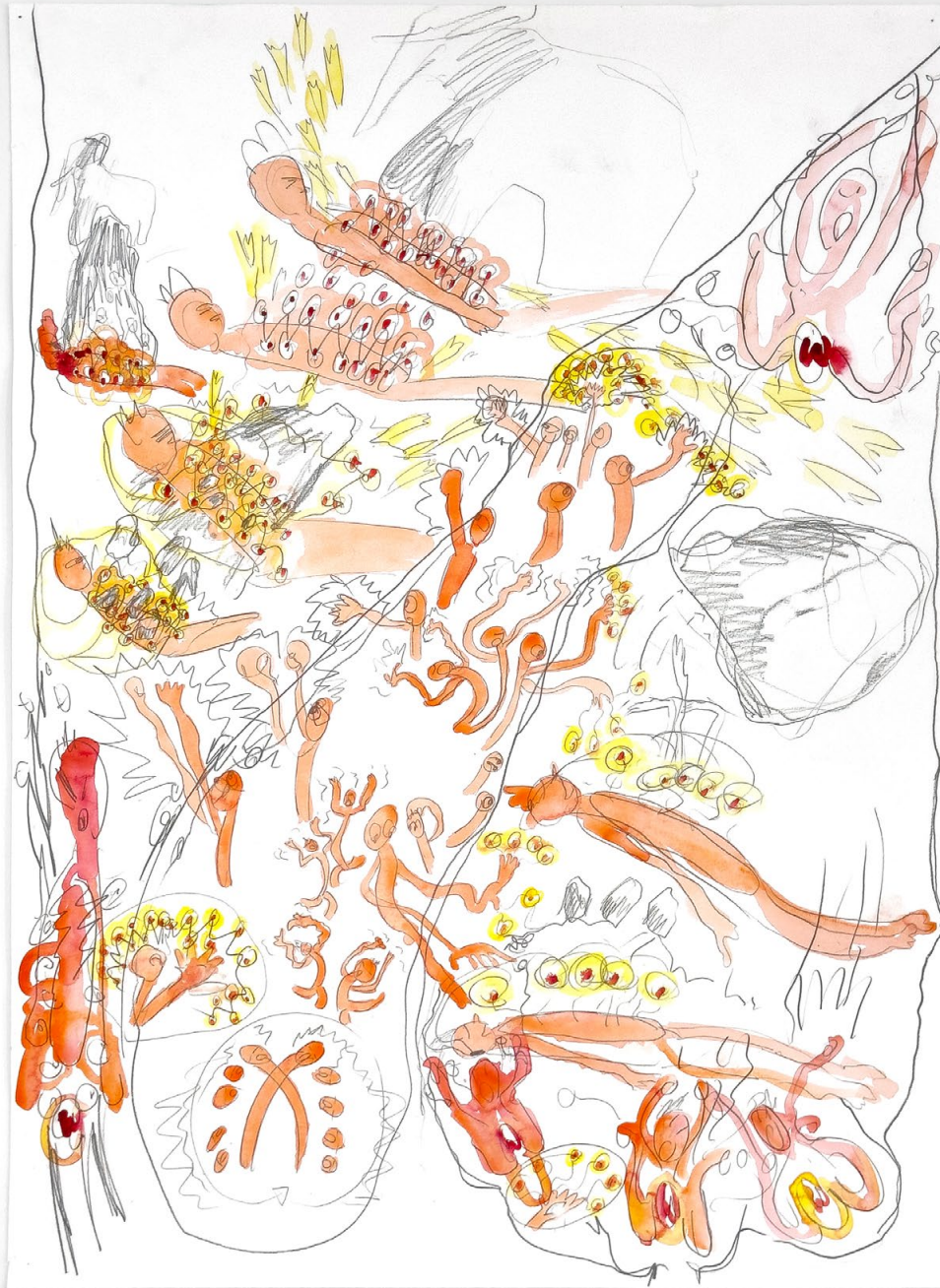
Deep Muscle Relaxation (series), 2019 Watercolor, pencil on paper 78.5 x 57 cm