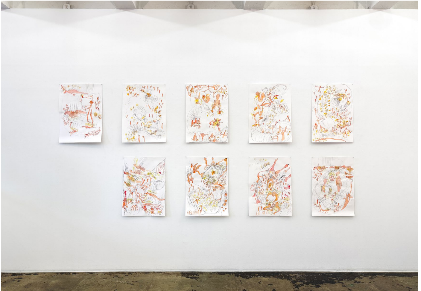
Deep Muscle Relaxation (series), 2019 Watercolor, pencil on paper 78.5 x 57 cm each

Györi's drawings are characterized by the rapid, yet confident fluidity of her graphite lines and her coded use of red, blue and yellow watercolor. Throughout her oeuvre, her works speak with an emotional immediacy and irrepressible vitality, even more so in the years following her diagnosis, seen in such series as Deep Jaw Relaxation , Deep Muscle Relaxation and Traumatizing a Lemon (all on view). In these, Györi instrumentalizes mind-body techniques to investigate the interconnection between her body, her sexuality, her symptoms and traumas in an attempt to heal herself. This holistic approach was often shared via performances and artist-led community events.