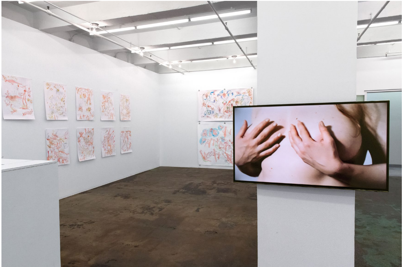
Installation view, south/east walls.

Talking to Breasts , 2018 HD Video 45 mins 46 secs Edition of 5 + 2AP