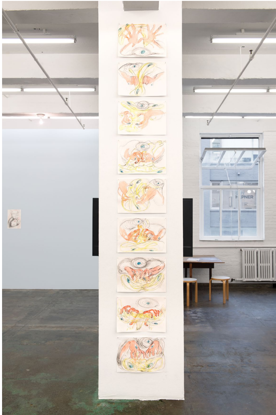
Traumatizing a Lemon (series), 2018 Watercolor, pencil on paper 29 x 42 cm each, 9 pieces

Installation view