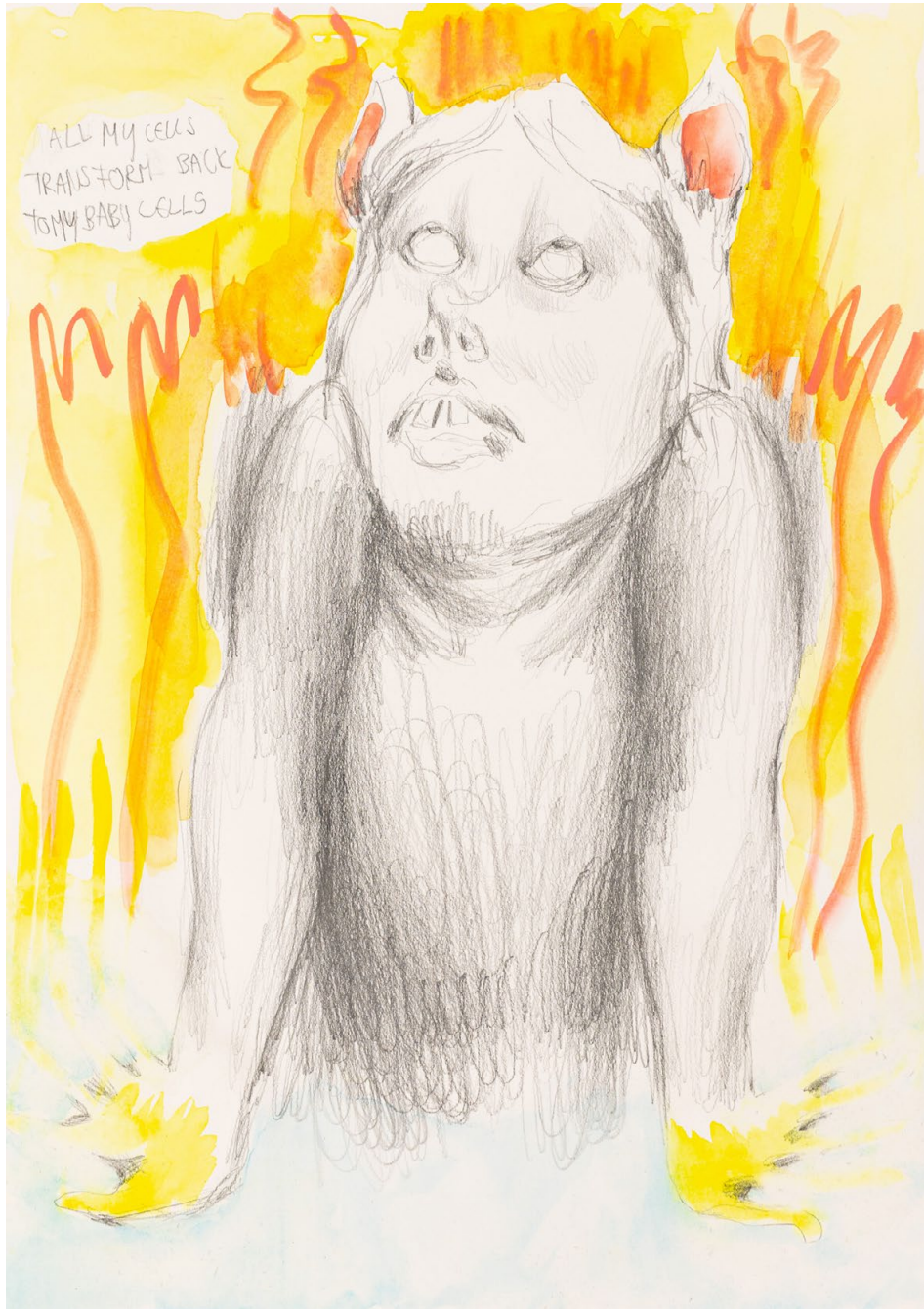
Untitled, 2022 Aquarelle, graphite on paper 42 x 29.7 cm