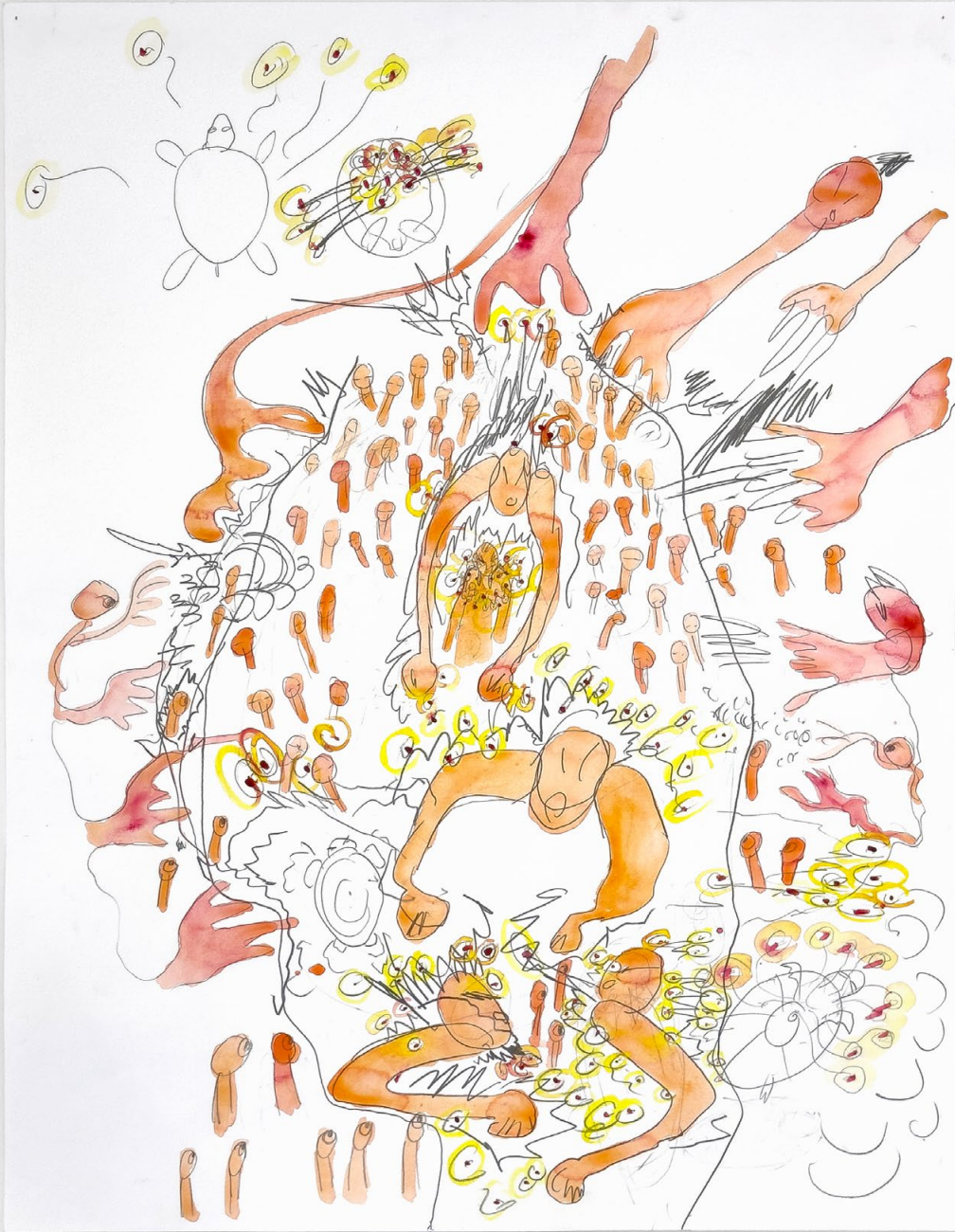
Deep Muscle Relaxation (series), 2019 Watercolor, pencil on paper 78.5 x 57 cm