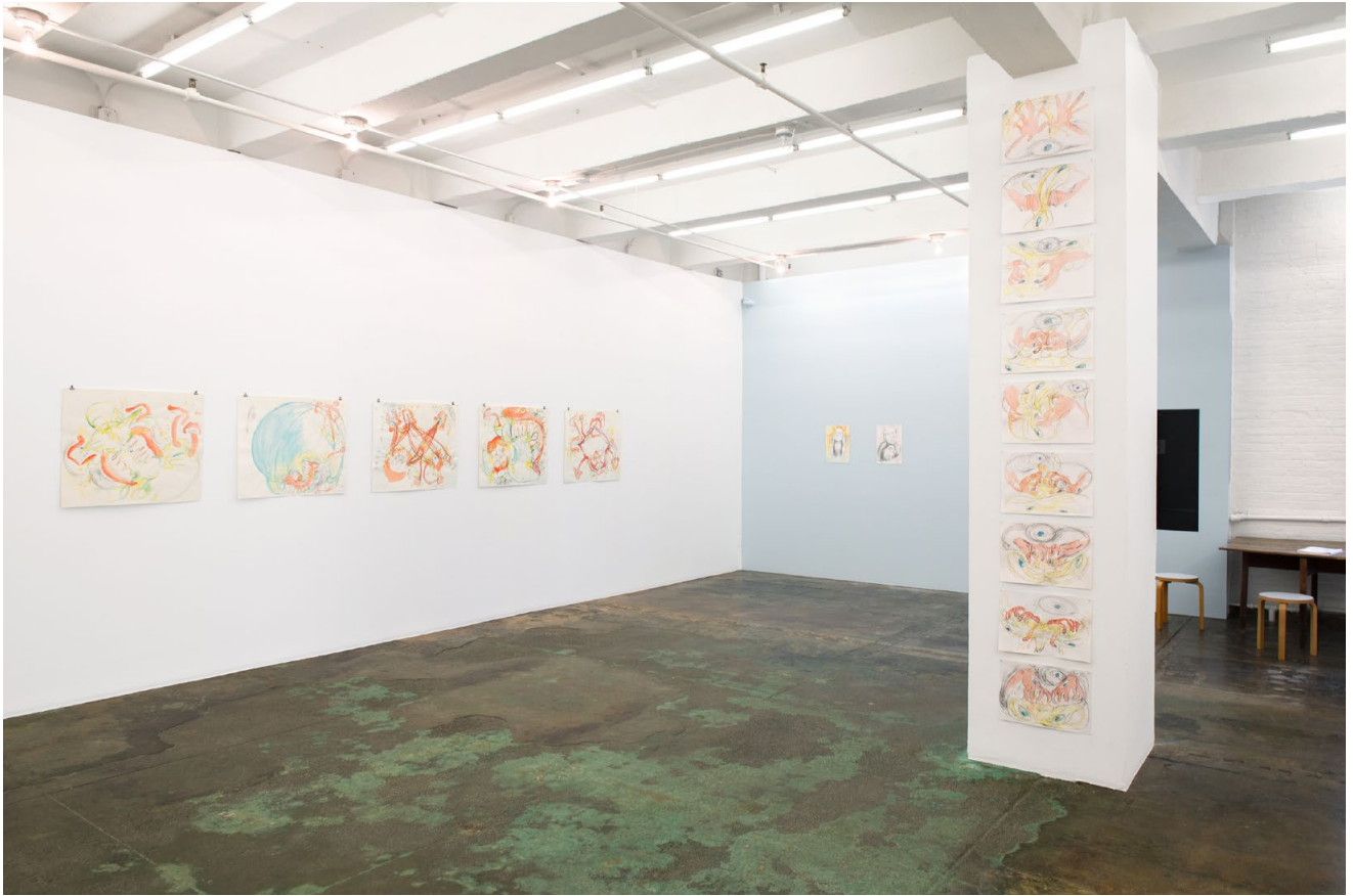
Installation view, north/west walls