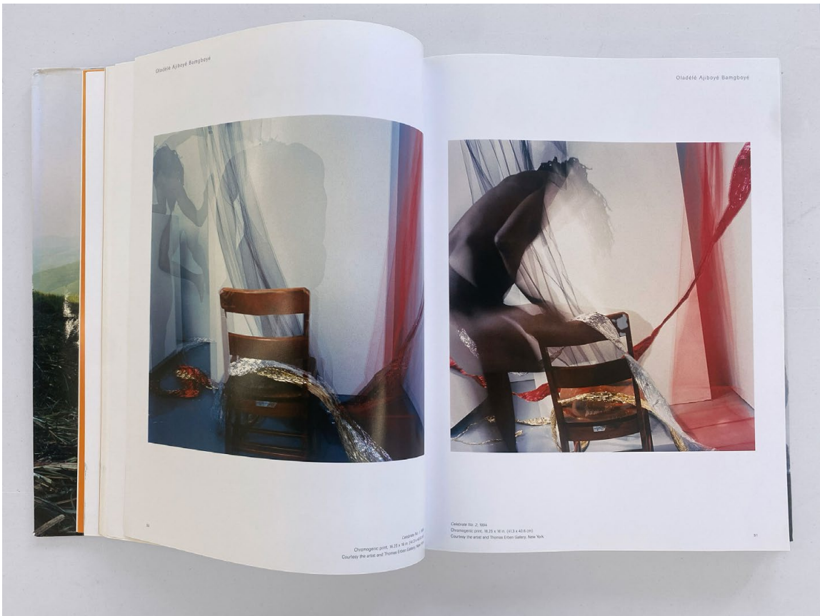
(Snap Judgments: New Positions in Contemporary African Photography, published in 2006)