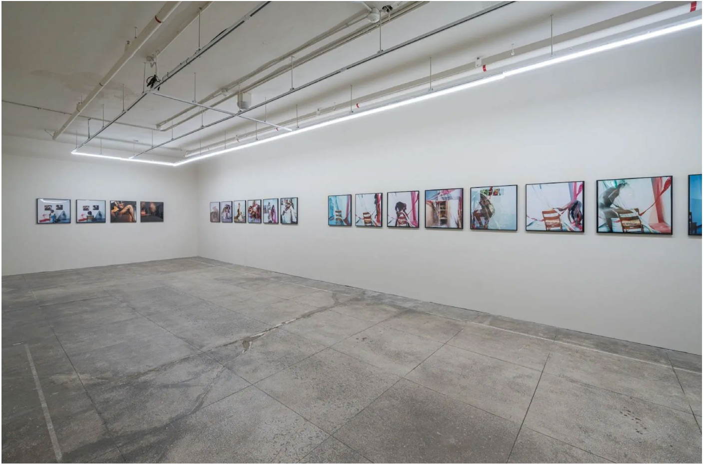
Busan Biennale, 2024