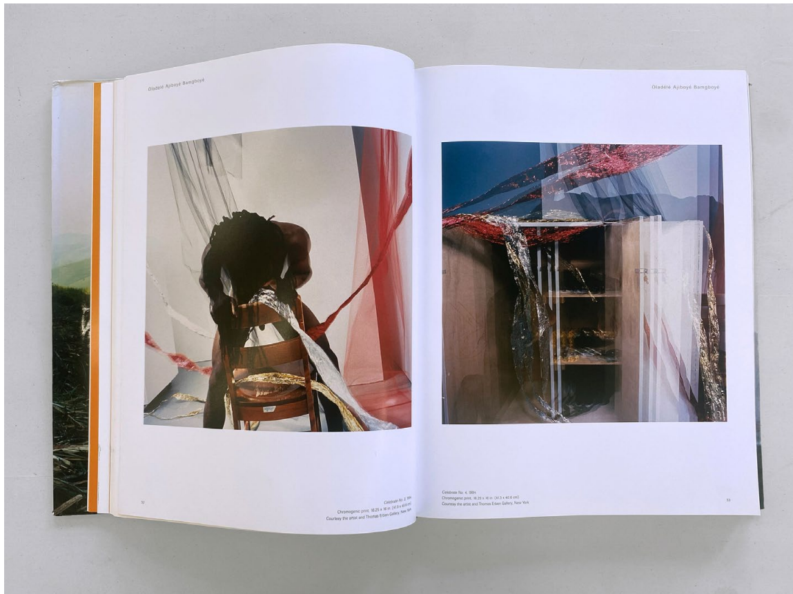
(Snap Judgments: New Positions in Contemporary African Photography, published in 2006)