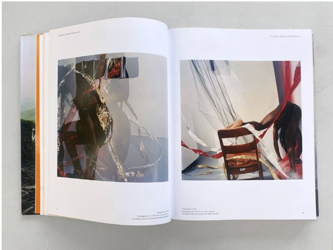
( Snap Judgments: New Positions in Contemporary African Photography , published in 2006)