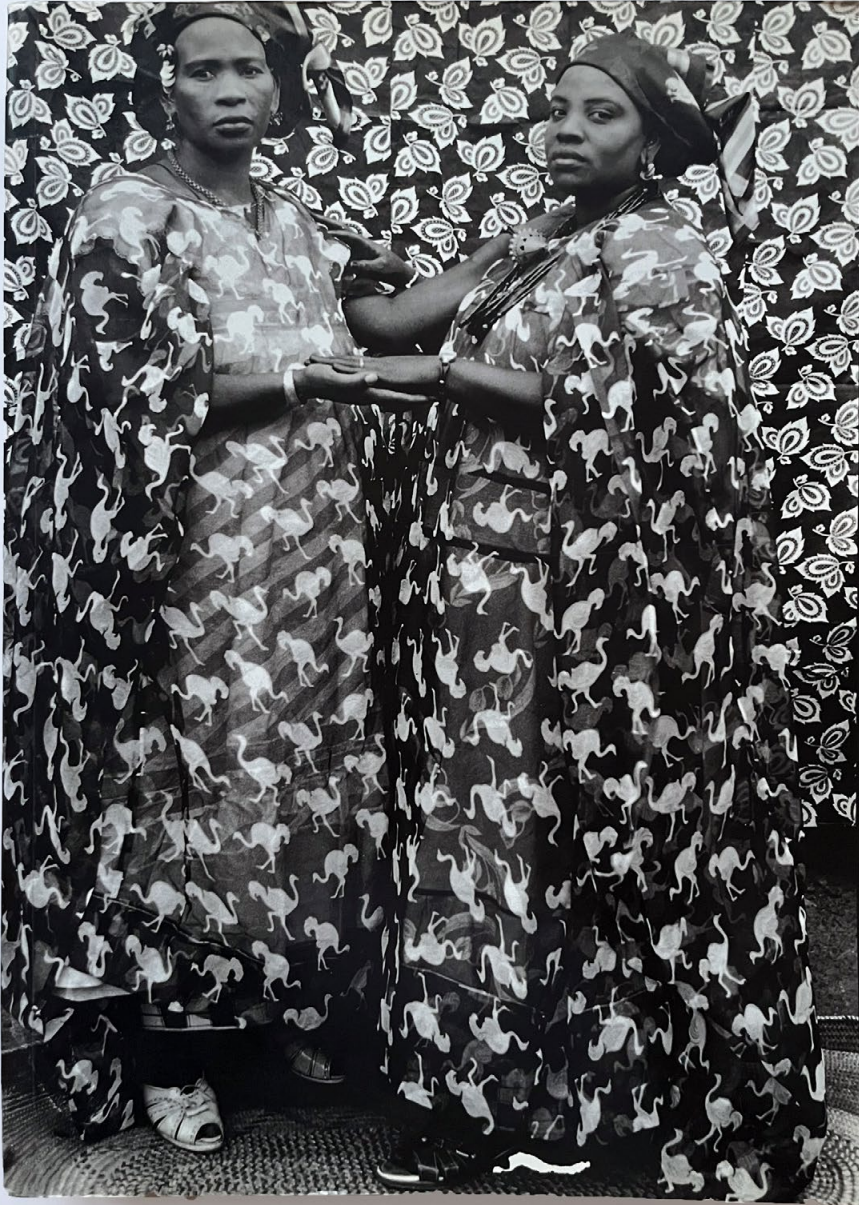
In/sight African Photographers, 1940 to the Present