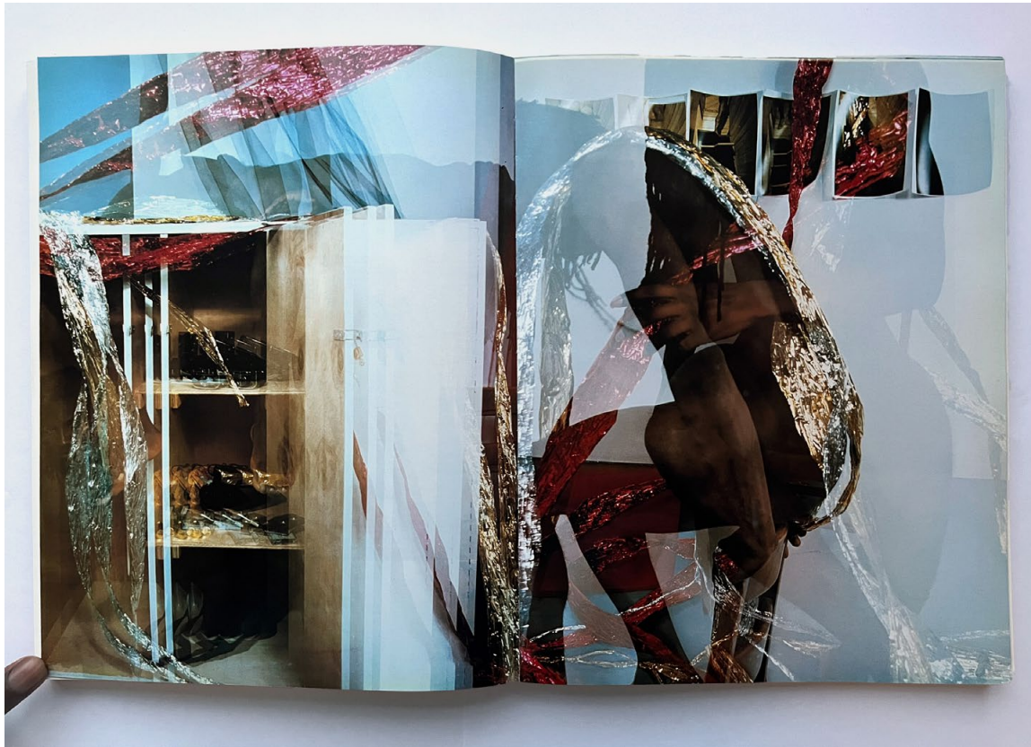
(In/Sight: African Photographers 1940 To The Present, published in 1996)