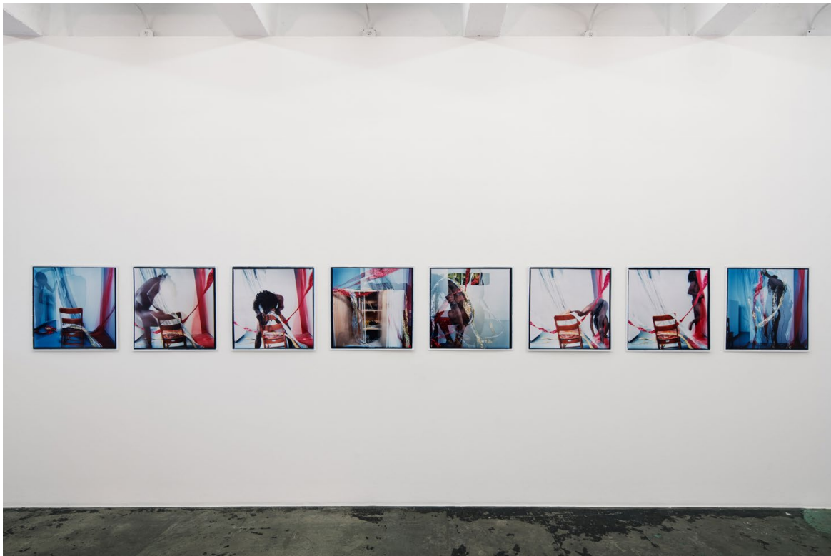
Thomas Erben Gallery, 2023

Celebrate #1-8, 1994 C-prints, 25 x 25 in. (each) Edition of 9 (+ 1AP)