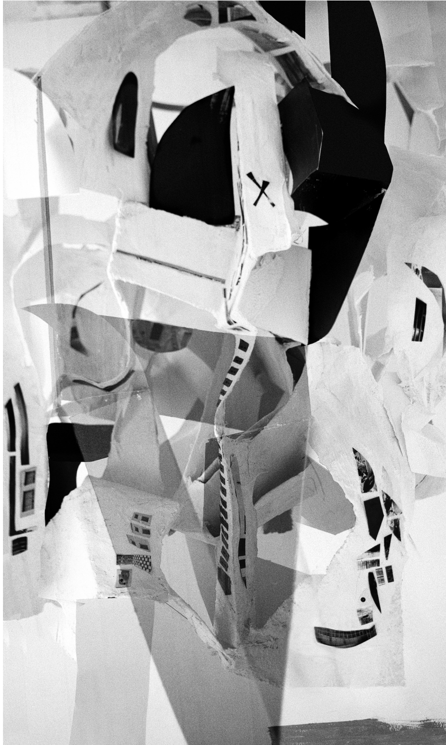
Animism , 2024 Silver gelatin print 50 x 30 inches Edition of 5 (+ 2 AP) Available are editions 4 and 5.