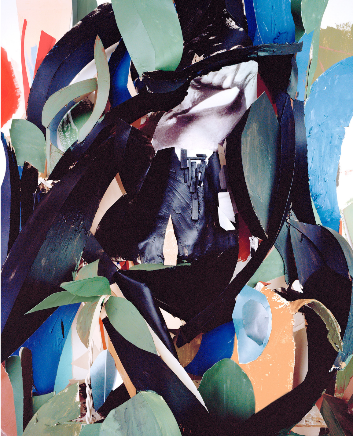
Echo and Eros, 2024 Archival inkjet print 45.5 x 34 inches Edition of 5 (+ 2 AP) Available are editions 4 and 5.