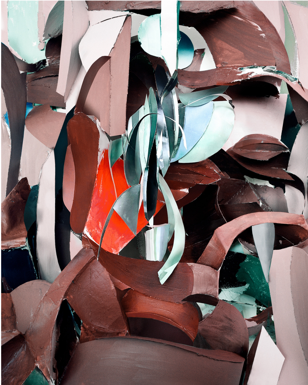
Feeding the Silkworm, 2024 Archival inkjet print 50 x 40 inches Edition of 5 (+ 2 AP) Available are editions 4 and 5.

With her newest body of work, Yamini Nayar has “settled into a mature style” (Loring Knoblauch, collector-daily.com). On view are Animism (center above) as well as Feeding the Silkworm and Echo and Eros , all in their last remaining editions of 5 (+ 2AP), see this PDF for complete info.