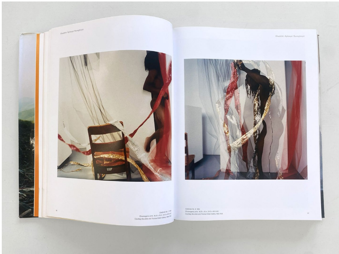
(Snap Judgments: New Positions in Contemporary African Photography, published in 2006)